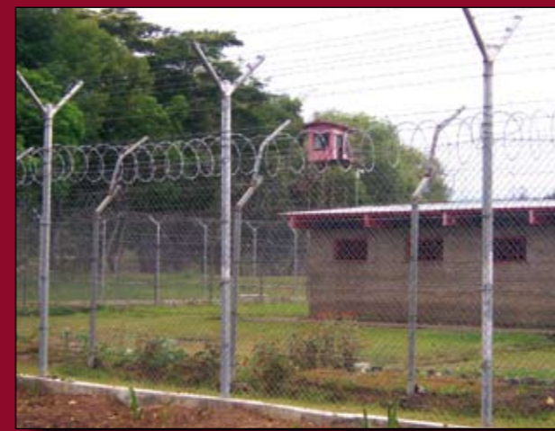
Bihute prison camp